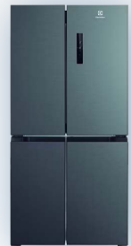
12-15 FTQ. Refrigerator