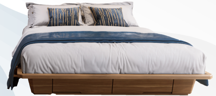
Pocket spring mattress King size - Master bedroom & Bedroom 2 - Queen size - bedroom 3