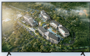
SMART TV with bracket 50"-55" Living room - 40"-43" Master bedroom