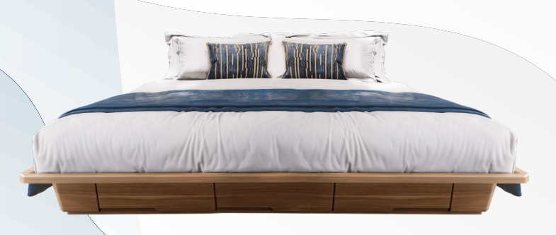
Pocket spring mattress 6ft. Master bedroom & Bedroom 2 & Bedroom 4 5ft. bedroom 3